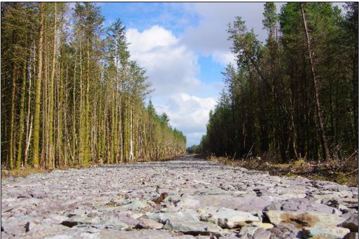
Plate 14-51: View of existing road and forestry containing proposed locations of T18, 19 and 20 from west