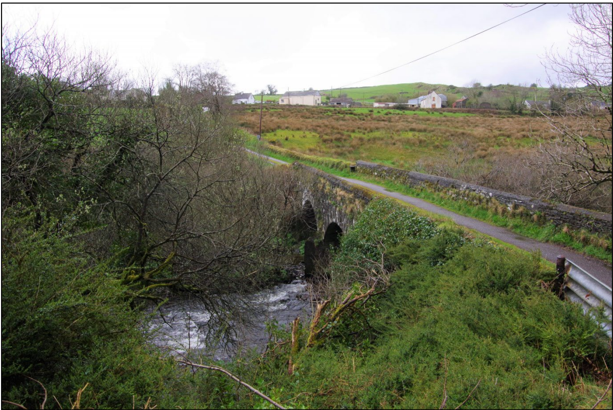
Plate 14-57: View from south of undesignated road bridge along section of grid connection route in Bawnmore, interventions to structure and river will be avoided by use of horizontal directional drilling