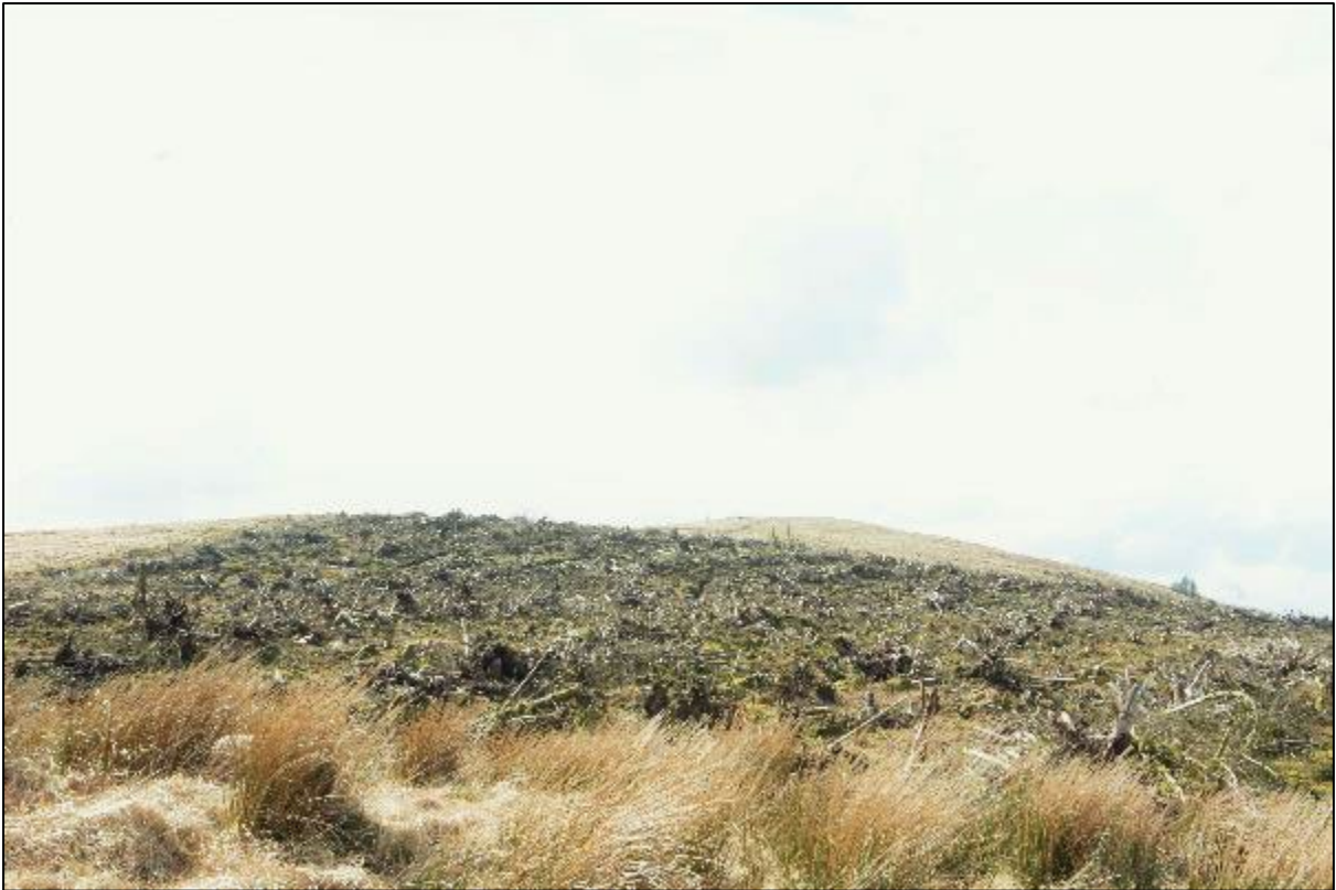
Plate 14-44: View of felling at proposed location of T14 from south