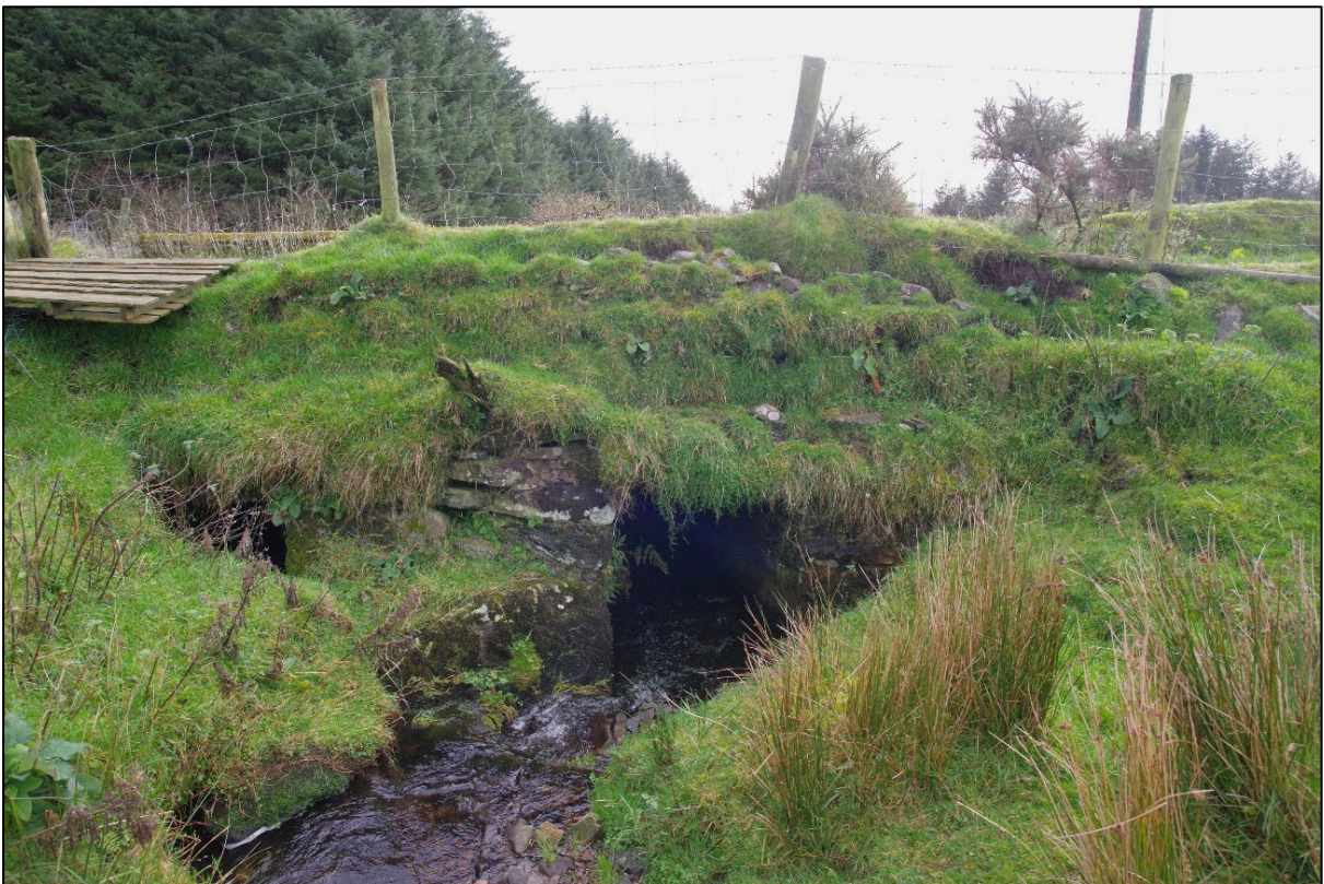
Plate 14-67: View from north of west culvert of bridge feature (Project ref. WF-HF8)