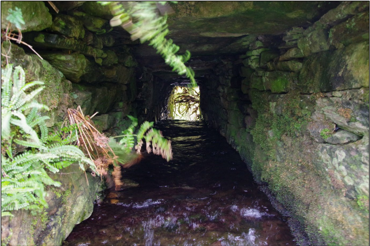
Plate 14-68: Bridge feature (Project ref. WF-HF8) showing west culvert