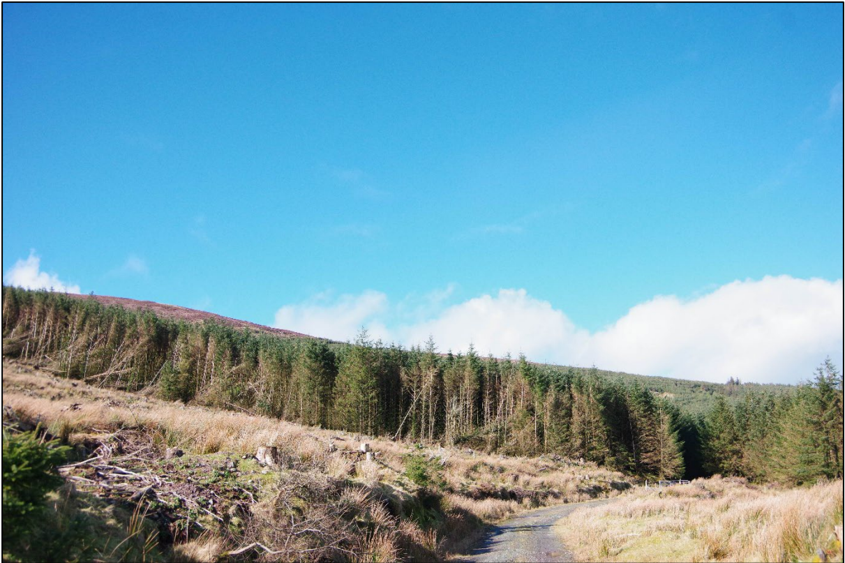
Plate 14-52: View of standing forestry within borrow pit area