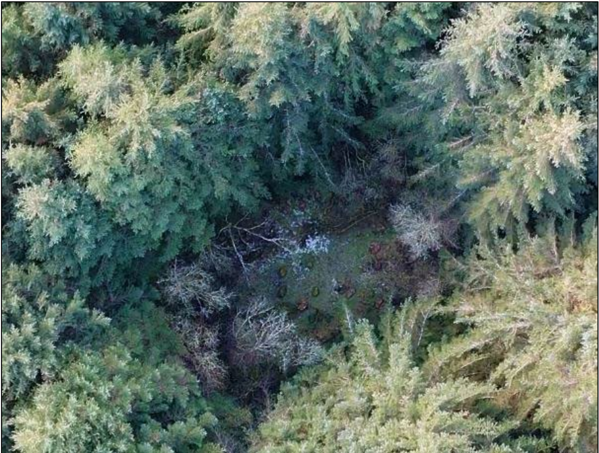
Plate 14-4: Drone view of Stone Circle (CO60-007----) showing extent of forestry screening