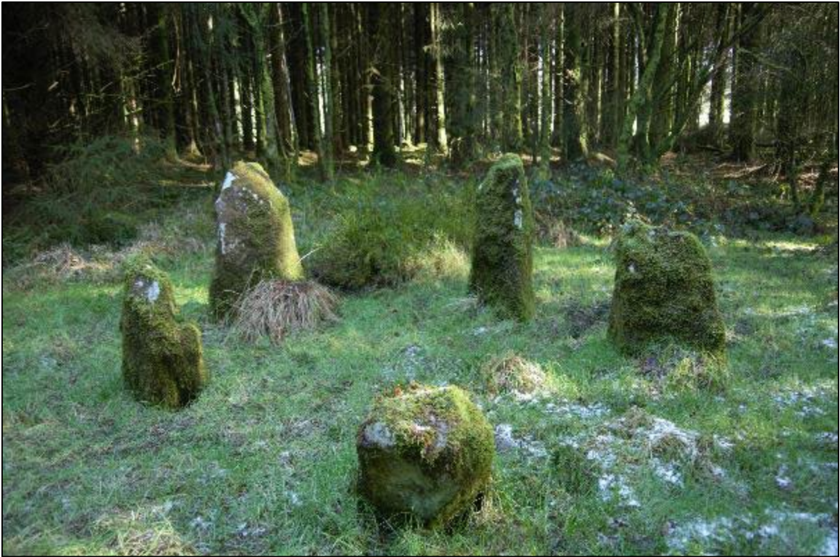
Plate 14-3: Ground level view of Stone Circle (CO060-008----) within forest clearing