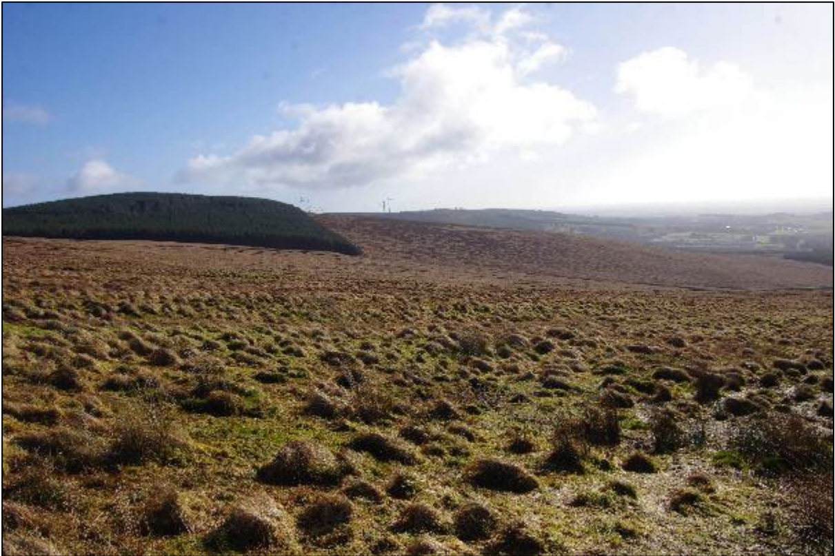
Plate 14-42: View of proposed access route and location of T13 from northwest