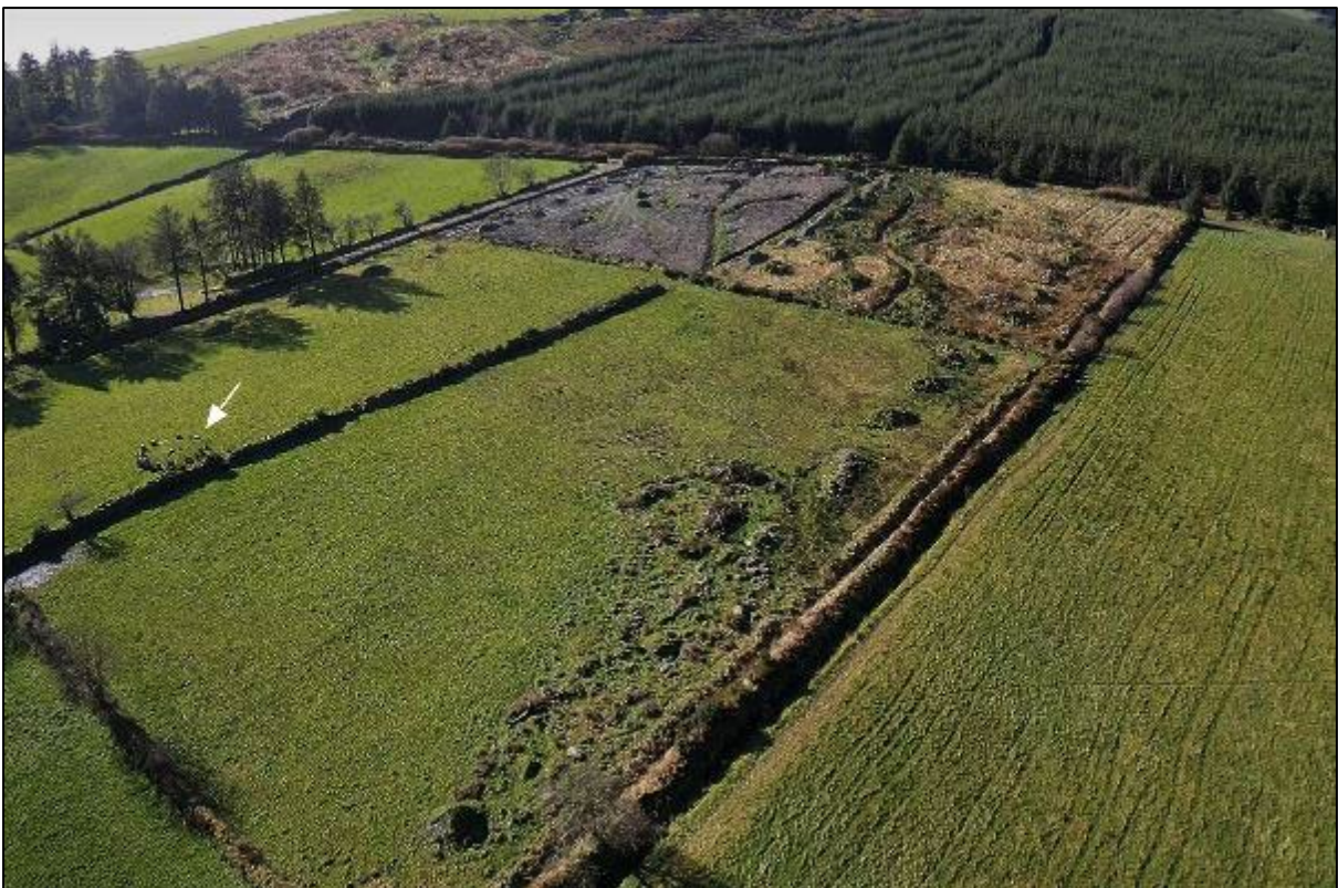
Plate 14-2: Drone view of Stone Circle (CO060-008----) with location indicated by arrow and surrounding land improvement works in adjoining fields also visible