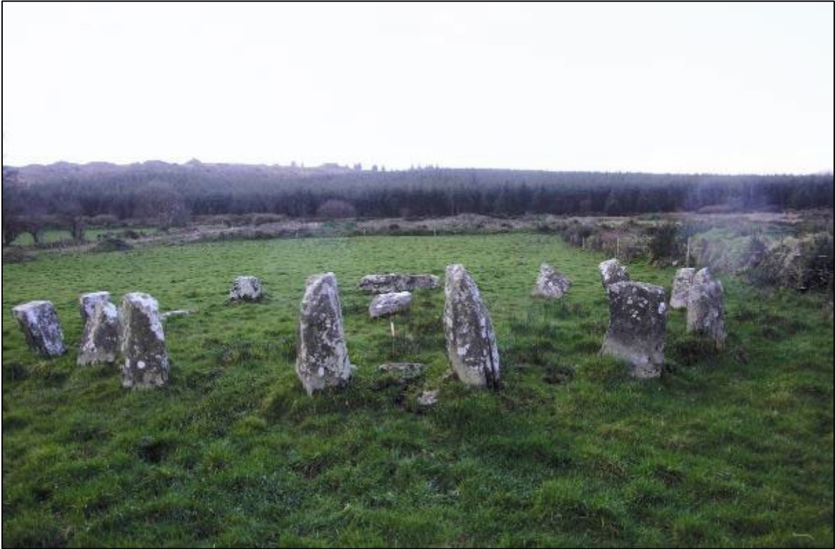
Plate 14-1: View of Stone Circle (CO060-008----) showing alignment to southwest in background