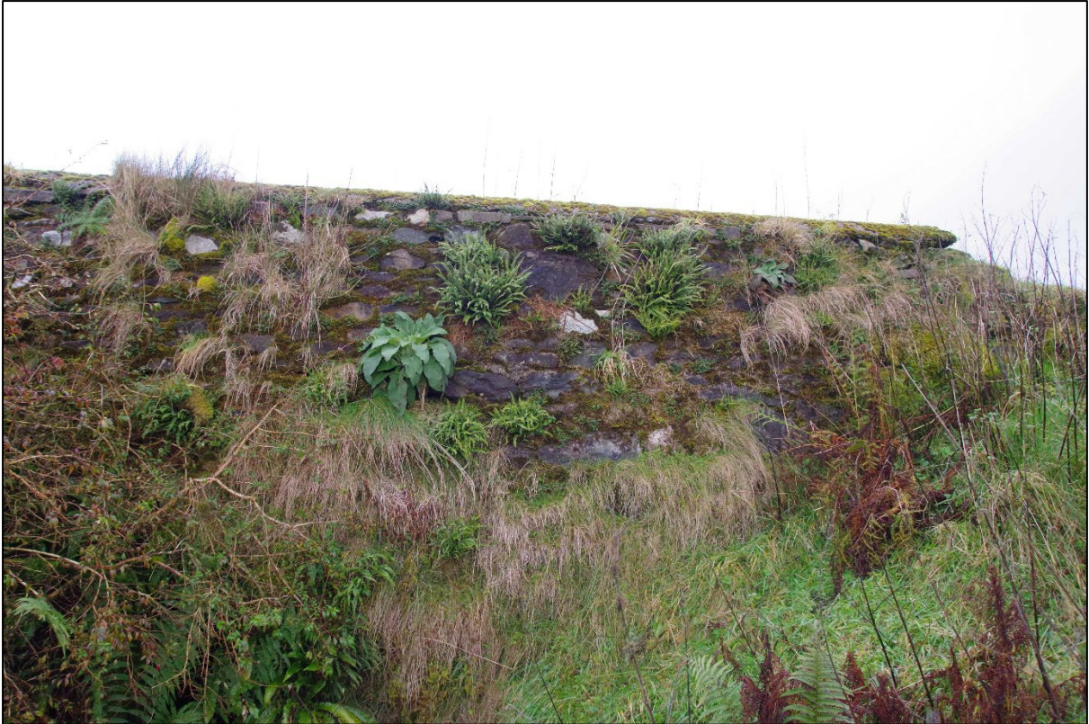
Plate 14-66: View from south of revetment of bridge feature (Project ref. WF-HF8)