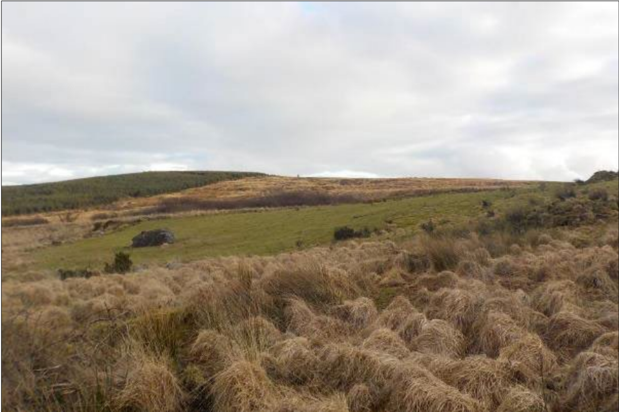
Plate 14-24: View south-eastwards across the proposed location of T2