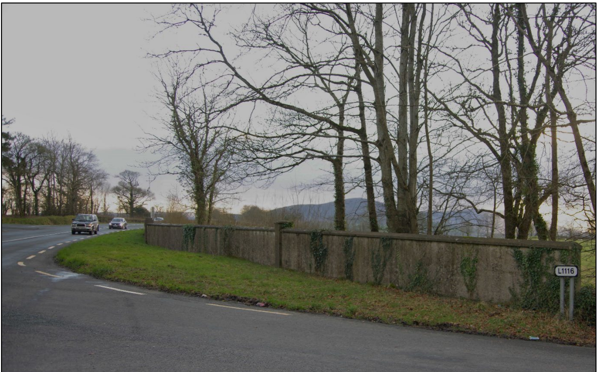
Plate 14-63: View from north of section of rebuilt modern boundary wall at proposed location of north entrance to the Drishane TDR staging area.