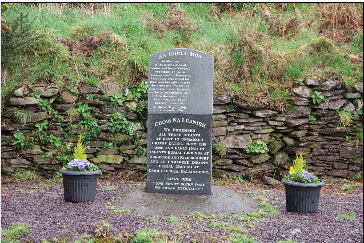
Plate 14-59: View of modern famine memorial set back from east side of road forming the grid connection route at a crossroads in Killberrihert townland