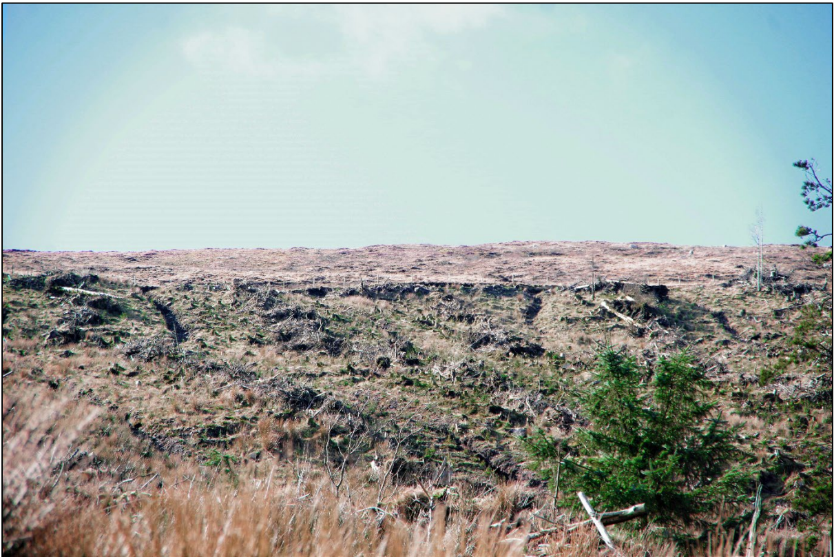
Plate 14-53: View of felled forestry within borrow pit area