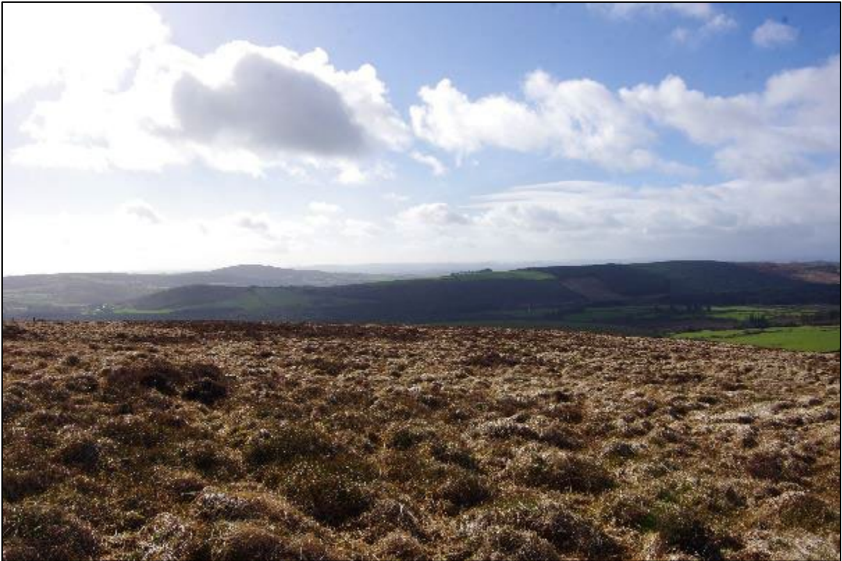
Plate 14-48: View towards proposed location of T17 from north