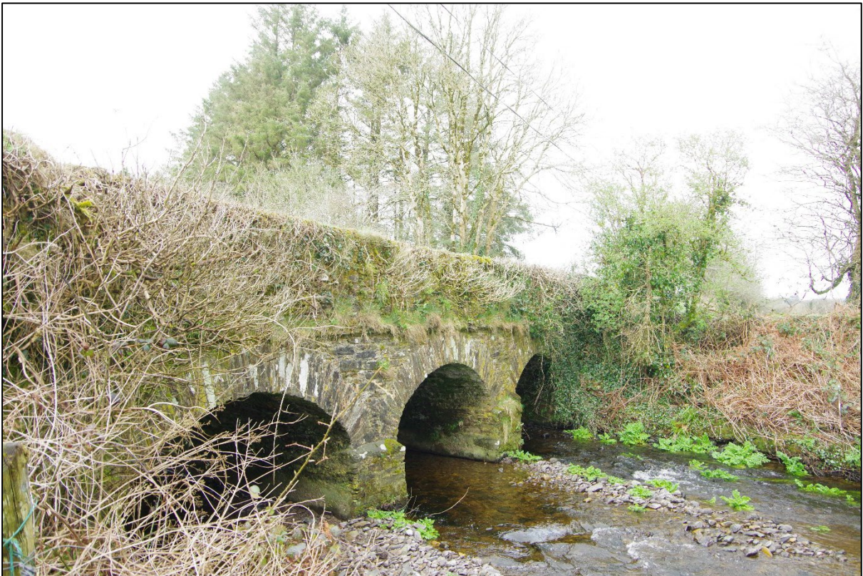
Plate 14-55: View of Bridge (CO060-002----) along grid connection route, interventions to structure and river will be avoided by use of horizontal directional drilling