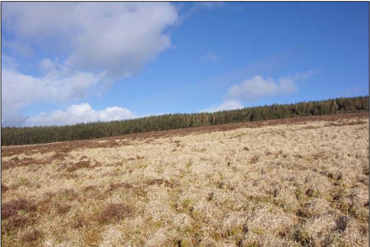
Plate 14-49: View of proposed access route to T17 from south