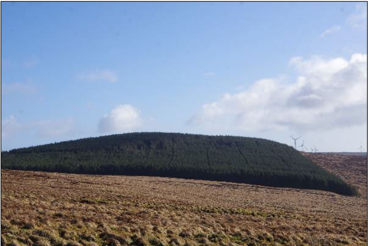
Plate 14-45: View towards forestry containing proposed location of T15 from west