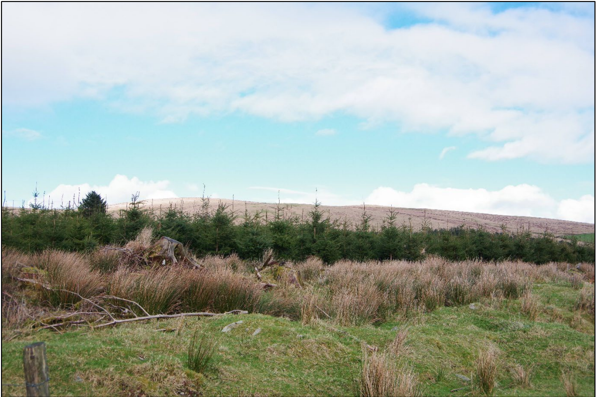
Plate 14-54: View of forestry at proposed site compound area from south