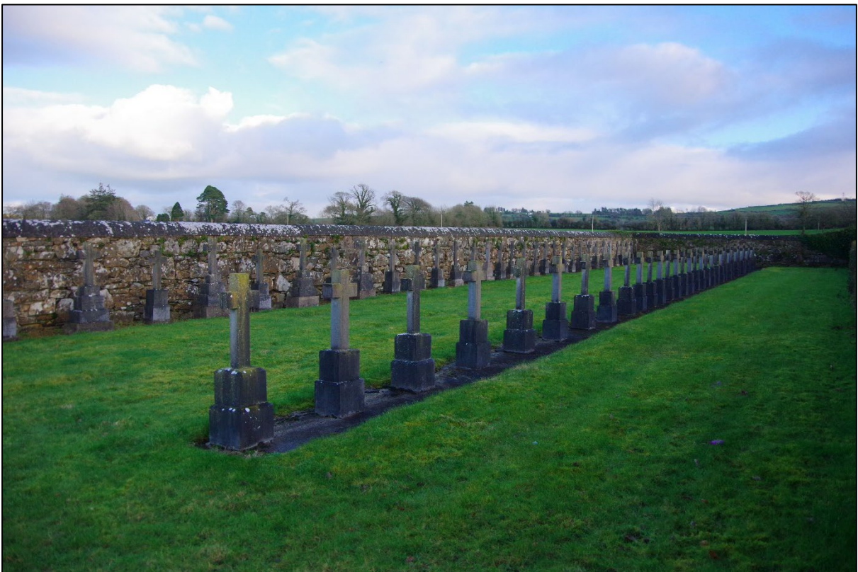
Plate 14-61: View of interior of modern Drishane cemetery towards proposed TDR staging area to south screened by boundary wall