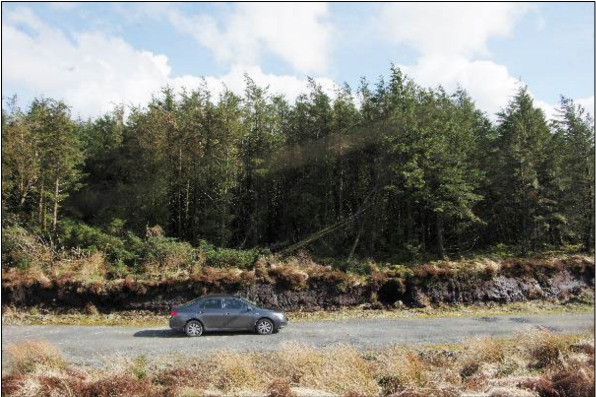
Plate 14-46: View towards forestry containing proposed location of T15 from north with cut section along existing forest road visible in foreground