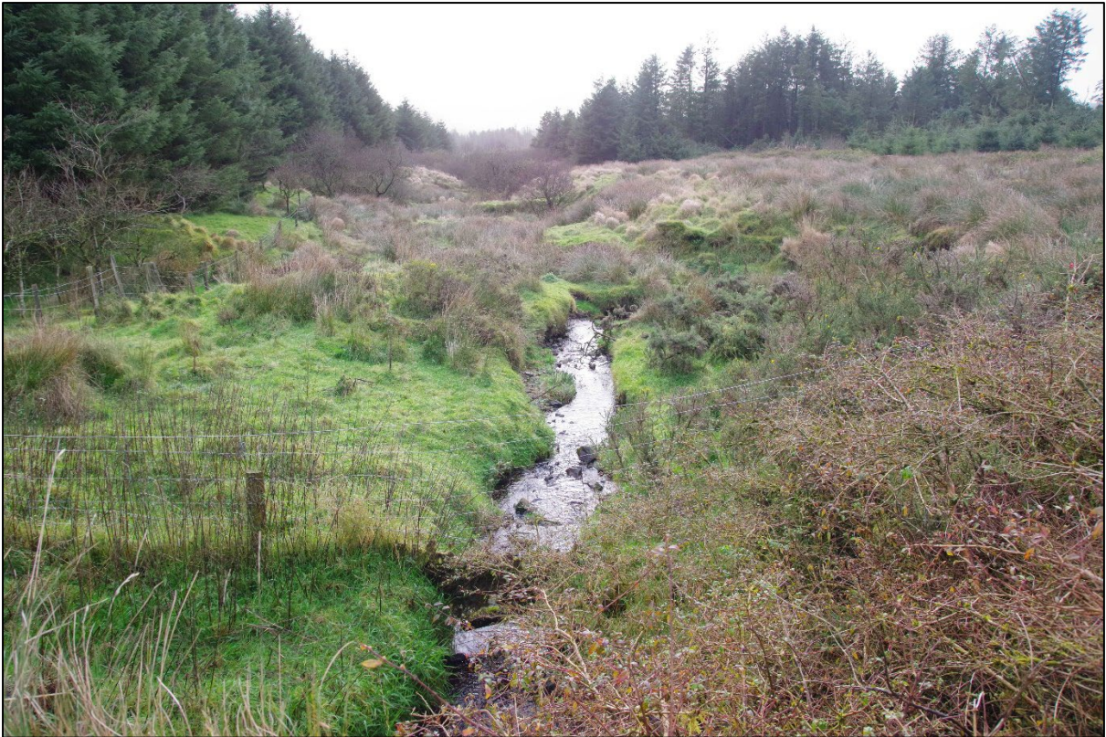
Plate 14-70: View of narrow stream at location of bridge feature (Project ref. WF-HF8)