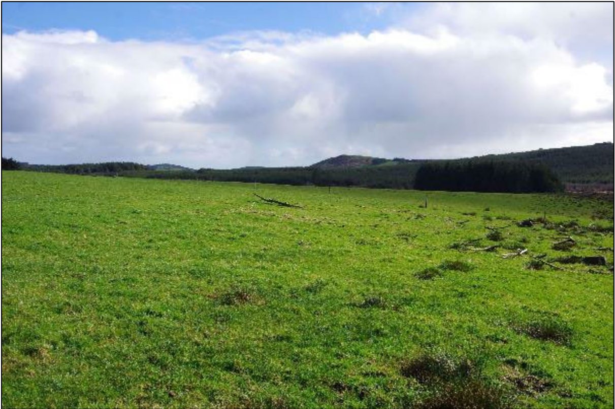
Plate 14-36: View of proposed location of T10 within improved grassland