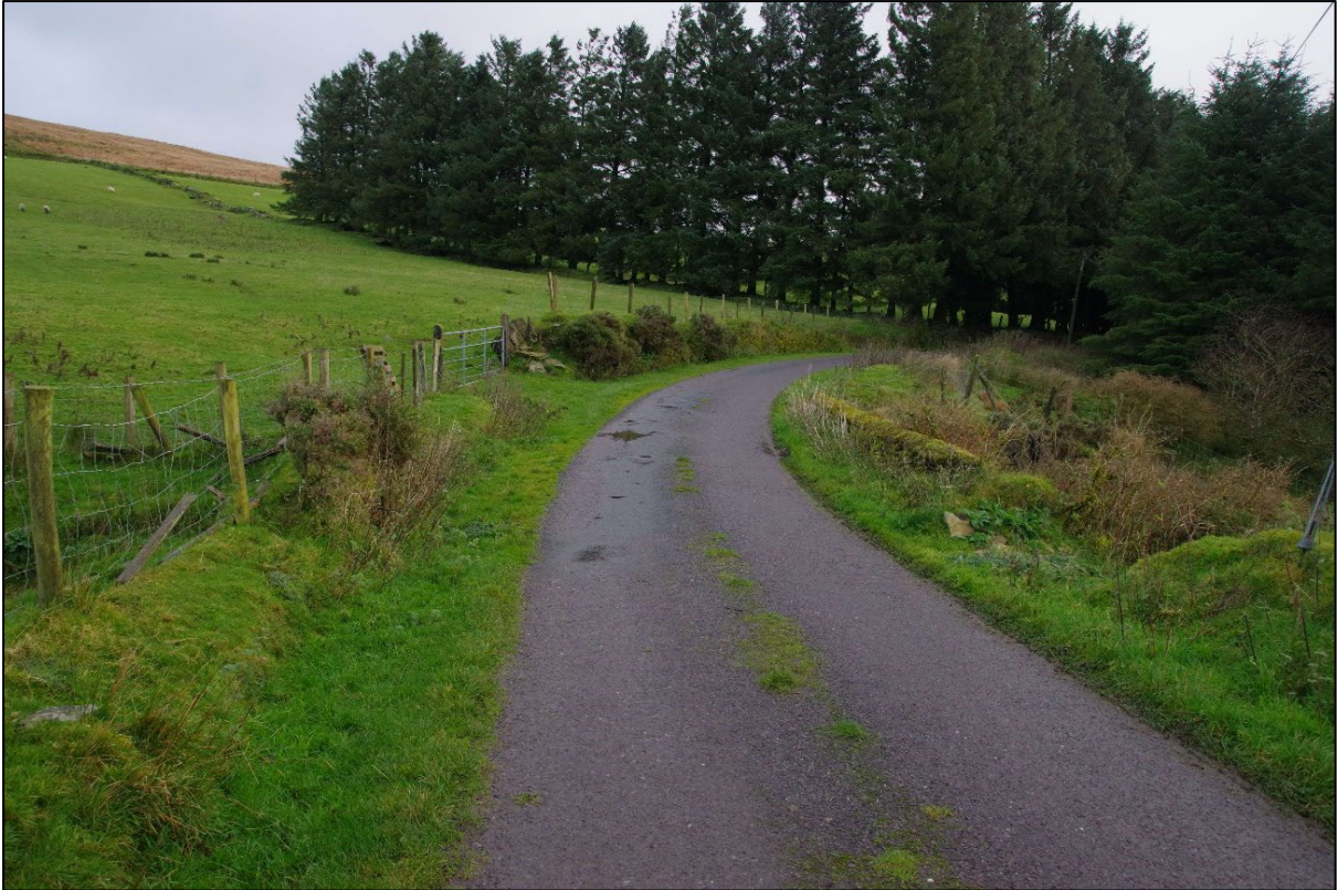
Plate 14-64: View from west of bridge feature (Project ref. WF-HF8) to be removed as part of TDR