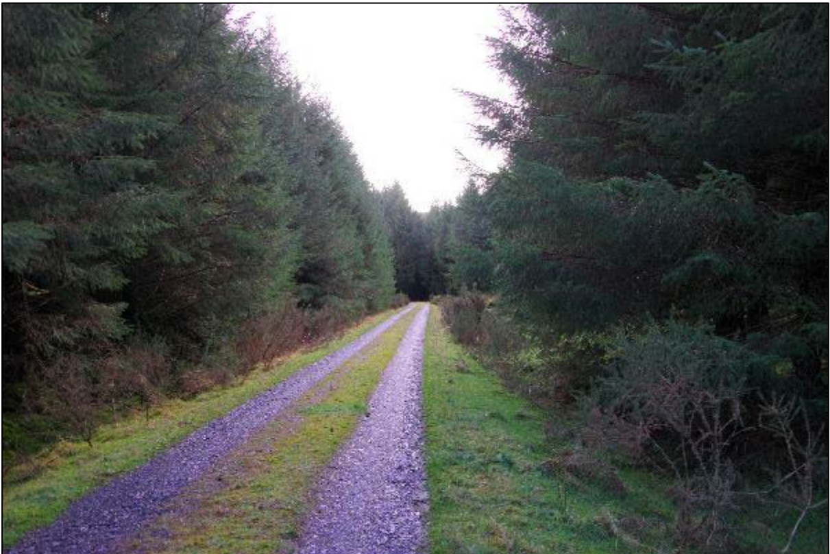
Plate 14-39: View of existing track and forestry at proposed location of T11