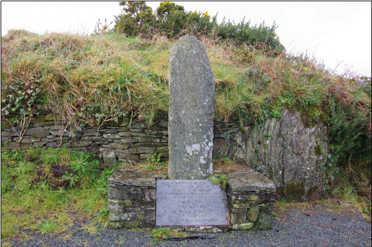
Plate 14-58: View of modern famine memorial set back from west side of road forming the grid connection route at a crossroads in Killberrihert townland