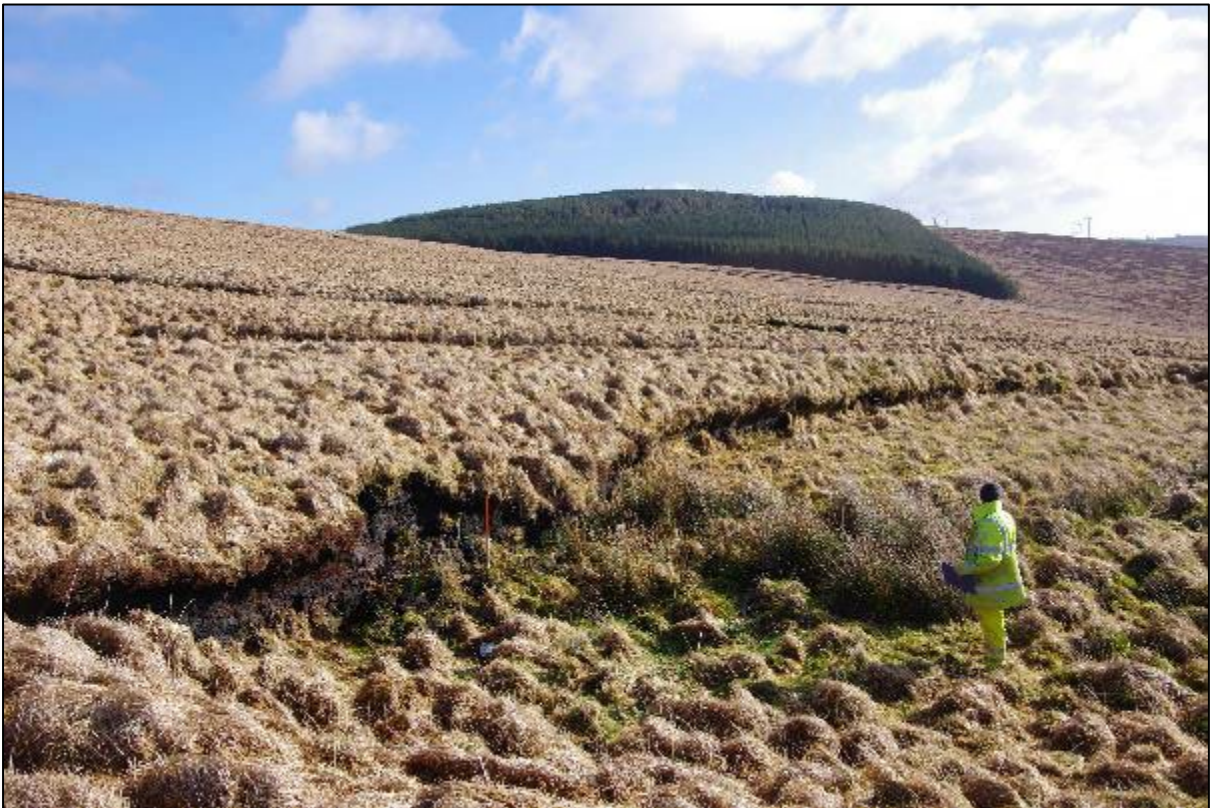
Plate 14-43: View of turf-cutting section within environs of T13