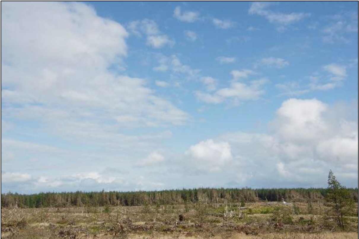
Plate 14-50: General view towards forest containing proposed locations of T18, 19 and 20 from west