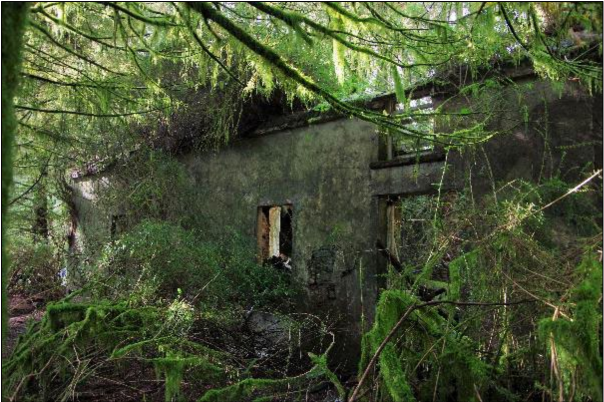
Plate 14-40: View of farmhouse ruins within forestry to southeast of proposed location of T11