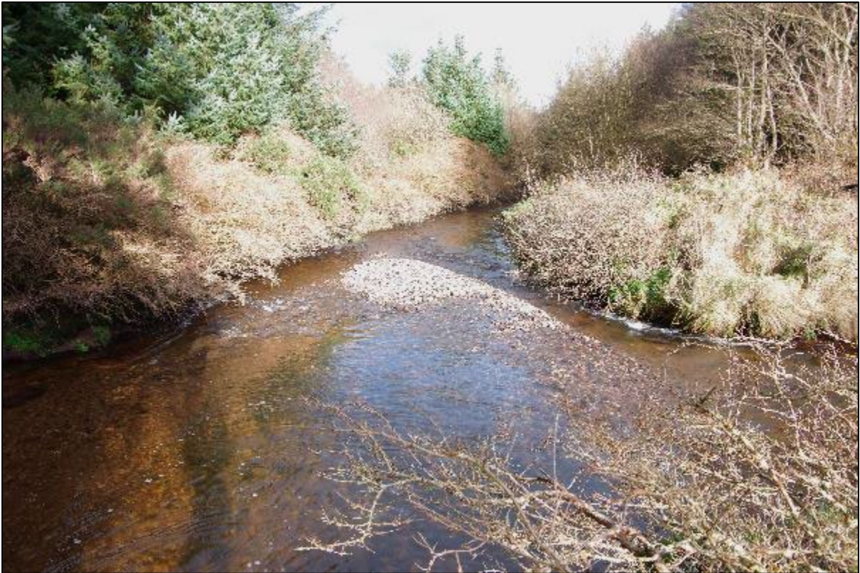
Plate 14-38: View of watercourse between T10 and T9 to be crossed by clear span bridge