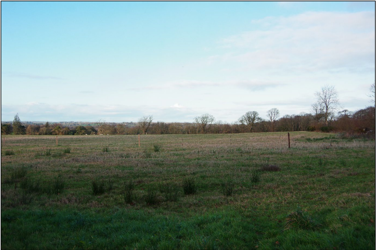
Plate 14-60: View of proposed TDR staging area within field in Drishane demesne from southwest