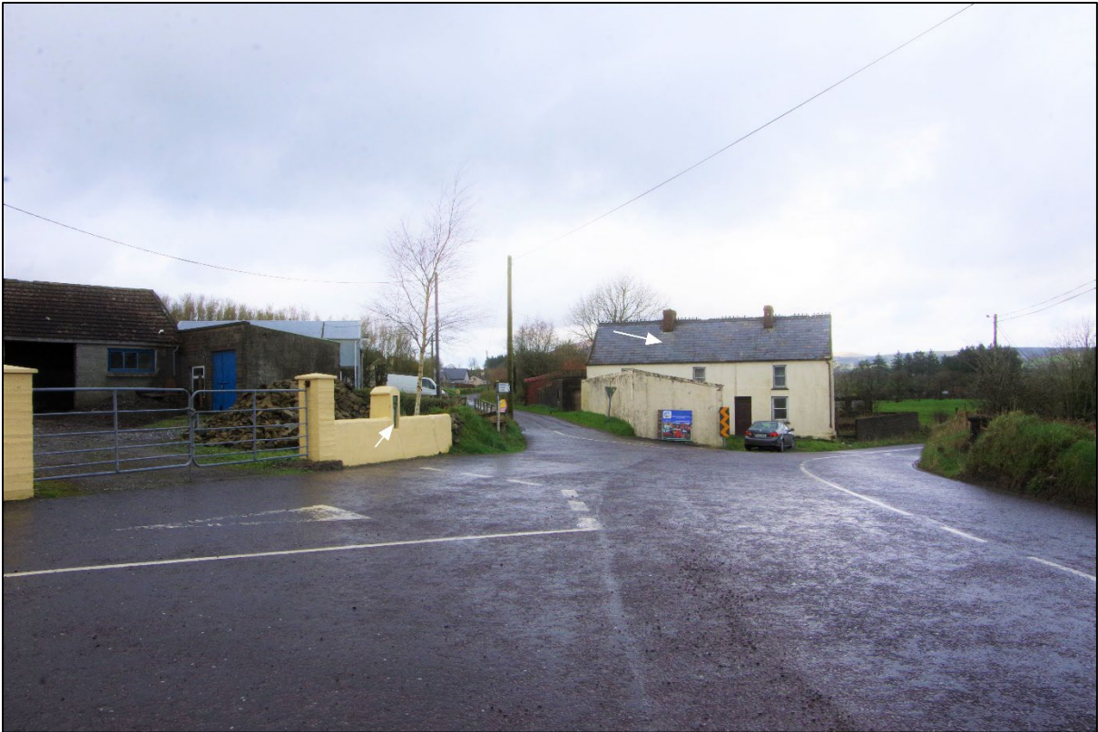
Plate 14-56: View of NIAH-listed house (NIAH ref. 20906002 ) and post-box (NIAH ref. 20906002) adjacent to road forming grid connection route in Bawnmore (both indicated with arrows)