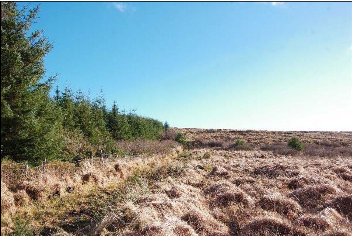
Plate 14-25: View from north of proposed T3 location