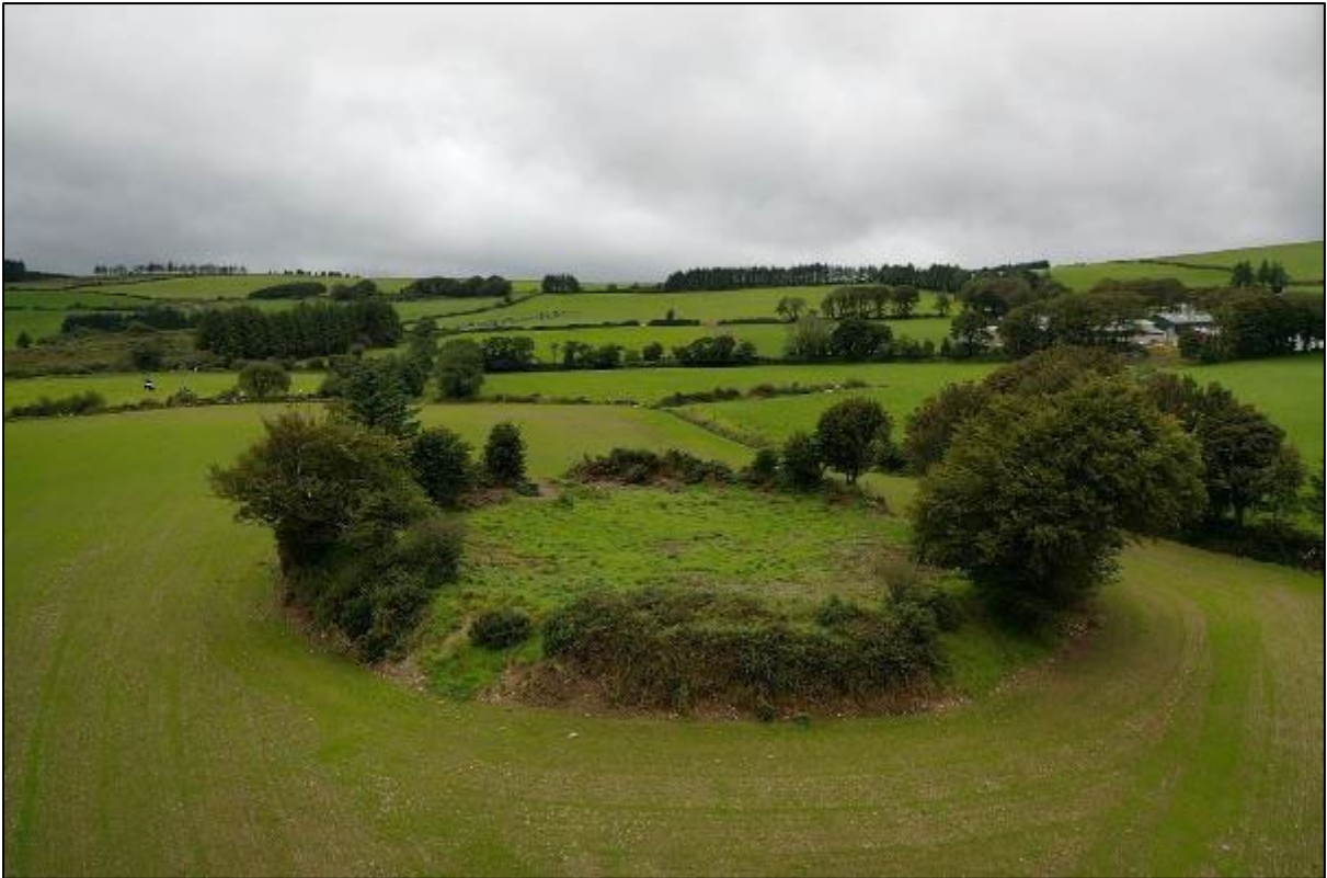
Plate 14-5: Drone view of ringfort (CO049-022) in Carrigagulla townland