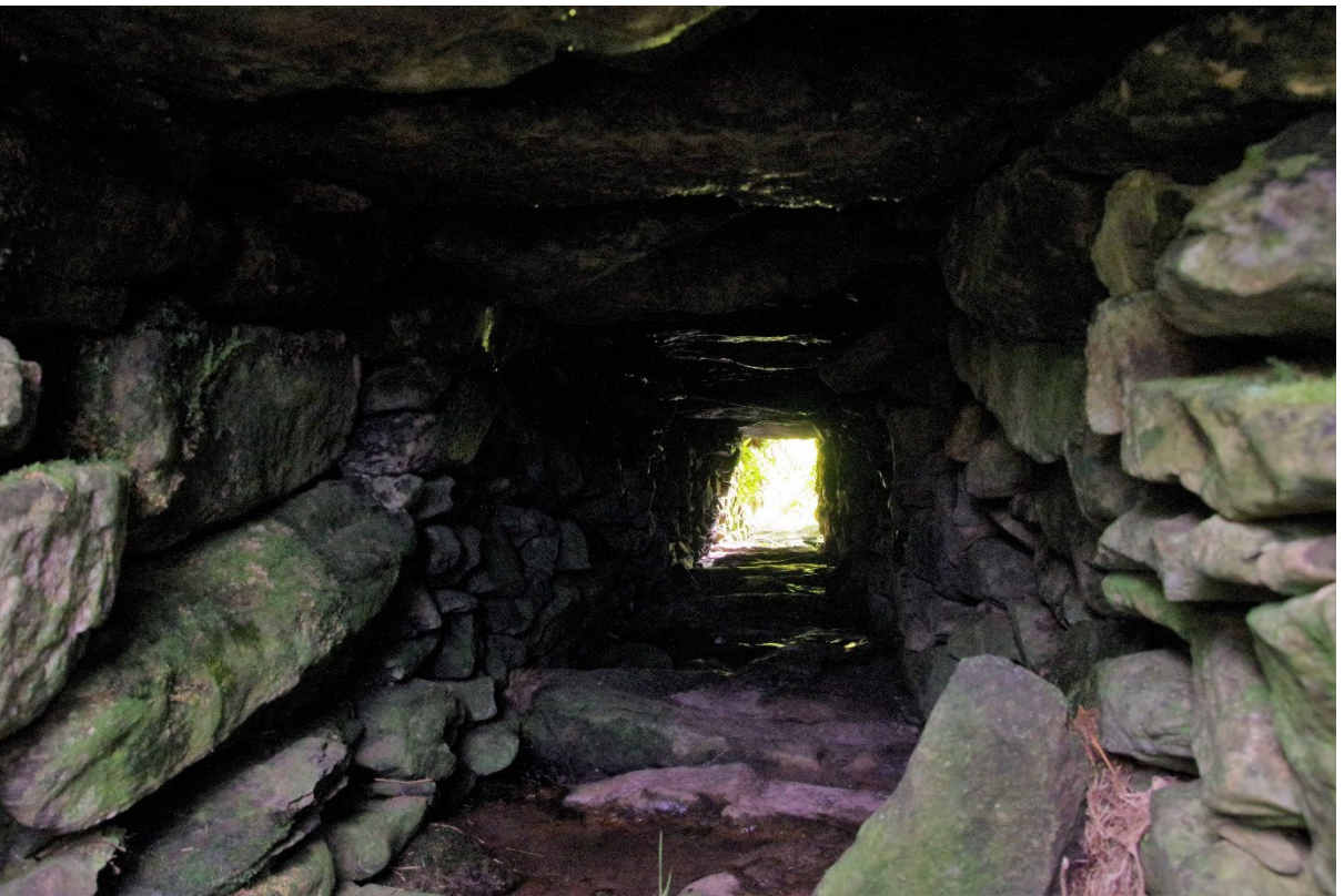
Plate 14-69: Bridge feature (Project ref. WF-HF8) showing dry east culvert