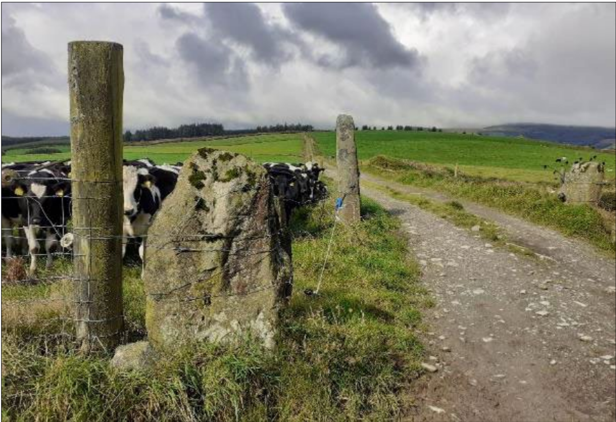
Plate 14-11: View of large upright stones in use as gate/fence posts in the vicinity of stone row (C0049-020----). No works are proposed at this location