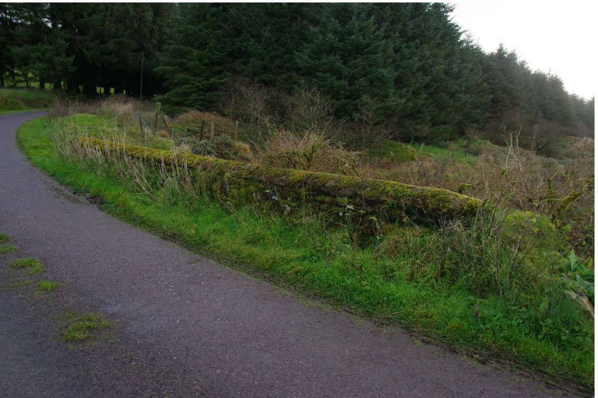
Plate 14-65: View of south parapet of bridge feature (Project ref. WF-HF8)