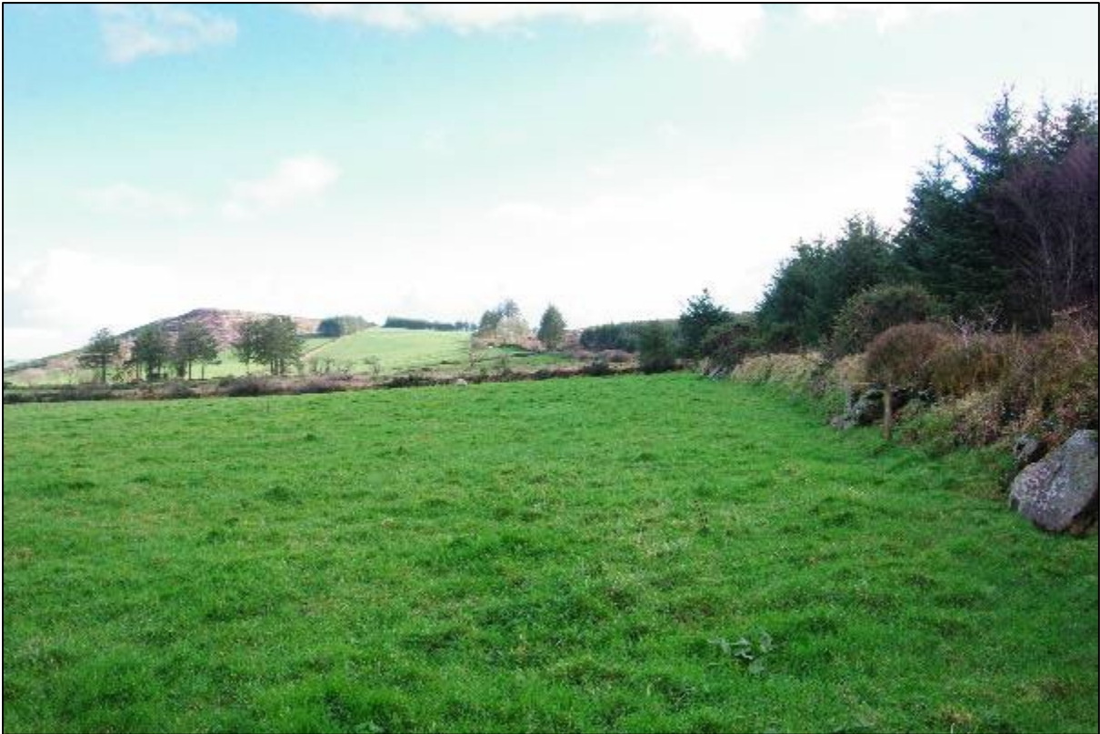
Plate 14-35: View of section of proposed T9 hardstand within area of improved pasture