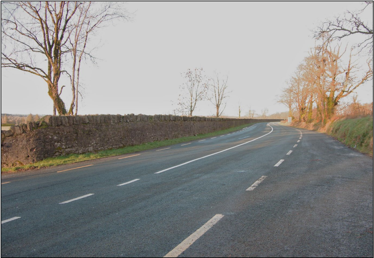
Plate 14-62: View from south of original Drishane demesne roadside wall adjacent to south end of proposed TDR staging area