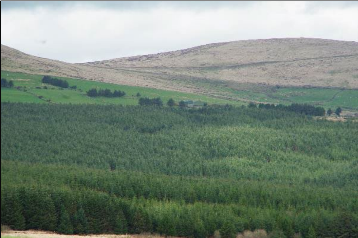
Plate 14-23: View of forestry at proposed location of T1 from south