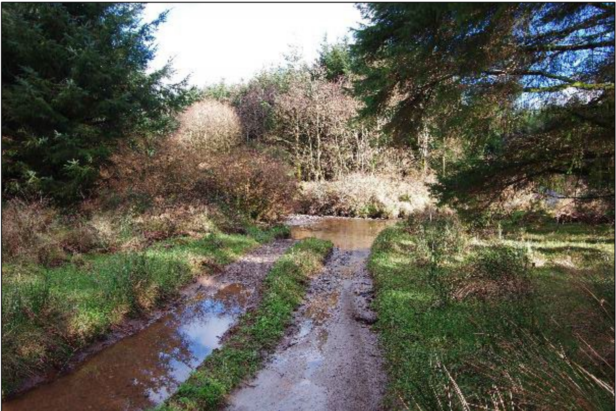
Plate 14-37: View from north of farm track and watercourse on access route between T10 and T9