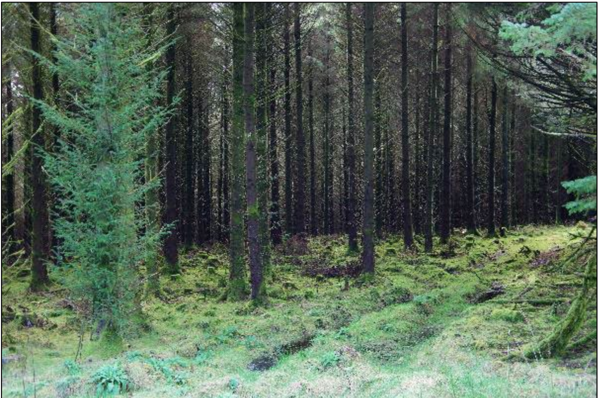
Plate 14-41: View of forestry at proposed location of T12